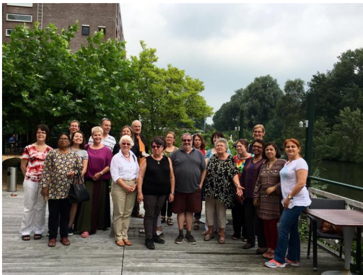
BD meeting, August 2016

The Board of Directors decides upon ongoing policy and priorities, policy implementation and the allocation of financial resources under the broad policy and priority guidelines established by the Organization.