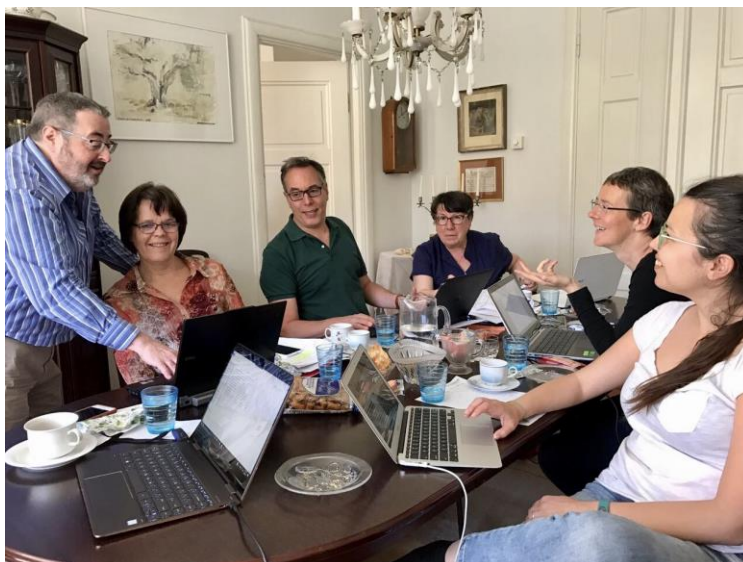
EC team 2015-2017