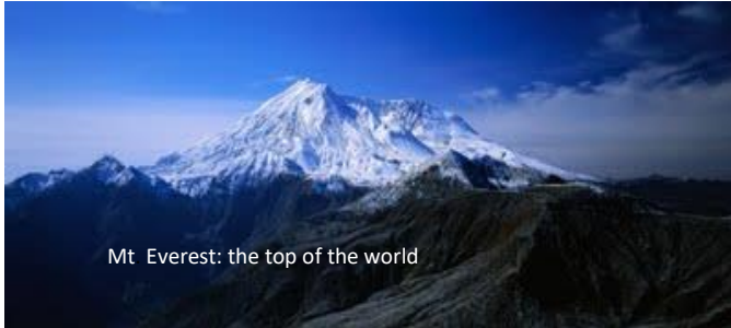
Mt Everest: the top of the world